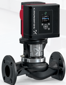
Available in single or dual head models.

Heating & Cooling Hot Water Recirculation