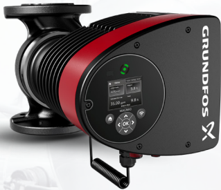
Available in single or dual head models.