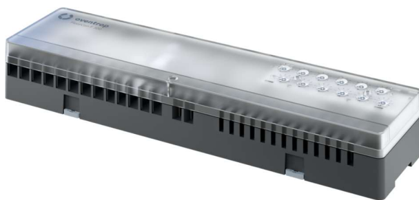
FloorCon F 300

Control and connecting block for adaptive hydronic balancing and electrical wiring of surface heating and systems.