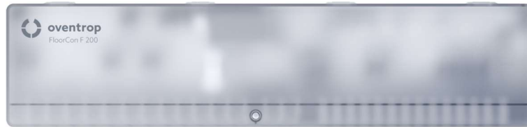
FloorCon F 200