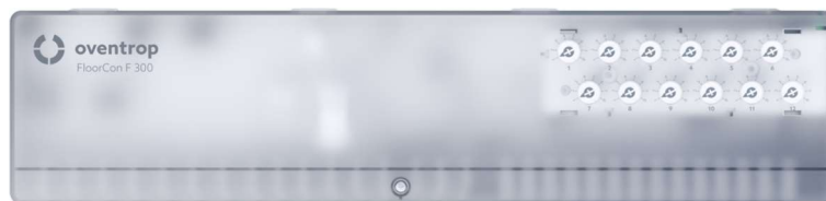
FloorCon F 300