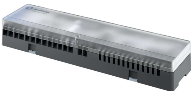
FloorCon F 200

Connecting blocks with adaptive hydronic balancing for surface heating systems